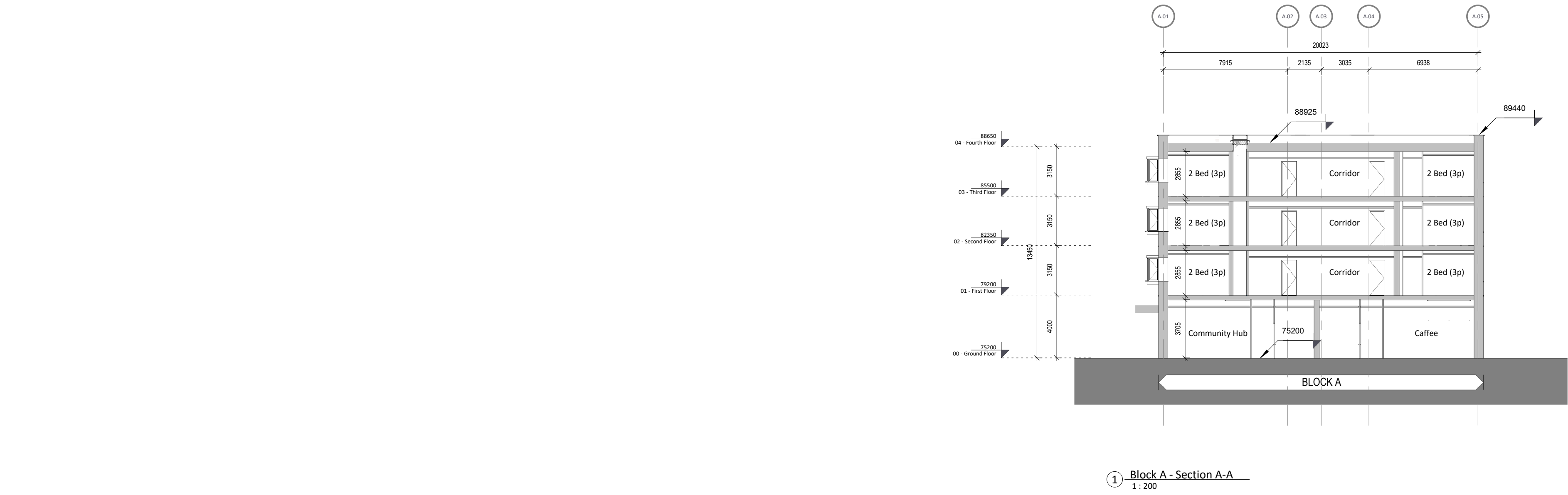
Block A Section